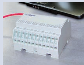
Mobile Use on a Desk