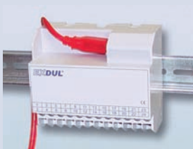
Top-hat Rail Mounting